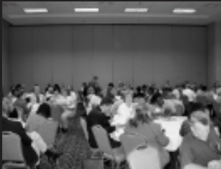
Another great turn-out at the HUD 2003 Peer-to-Peer Conference.