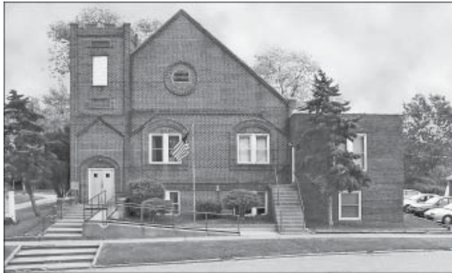
The main Good Samaritan facility houses all the agency's programs, except the Food Pantry.

Good Samaritan Ministries is non-denominational and neither holds nor requires participation in religious services as a condition to receiving benefits from its various services.